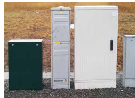
Göteborg Energi cable cabinets