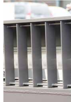
Noordbrug Kortrijk Bridge